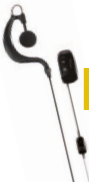
WA21 C1201 - WA31 C1202 - WA29 C1203 Bluetooth headset microphone with PTT