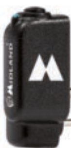
WA-DONGLE C1199 Bluetooth dongle for 2 Pin radios (also for portable models)